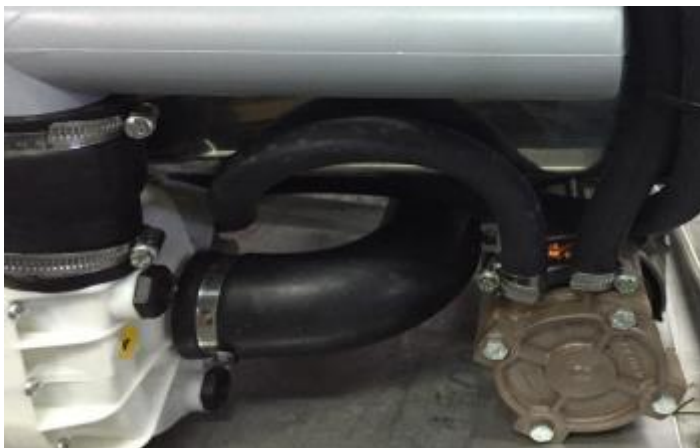
Rinse presure pump

Pump for 330 ltr./min. circulation in the wash system