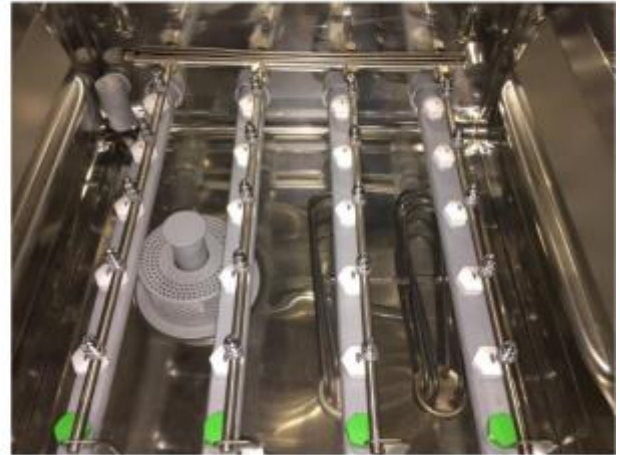
The new wash and rinse system